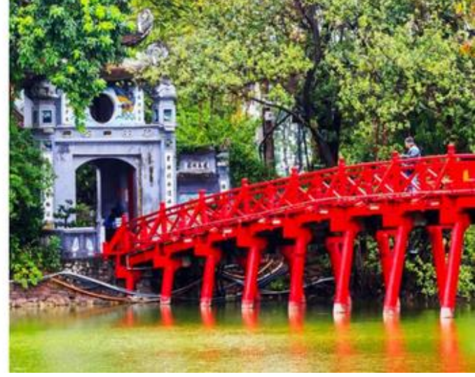
Tran Quoc Pagoda