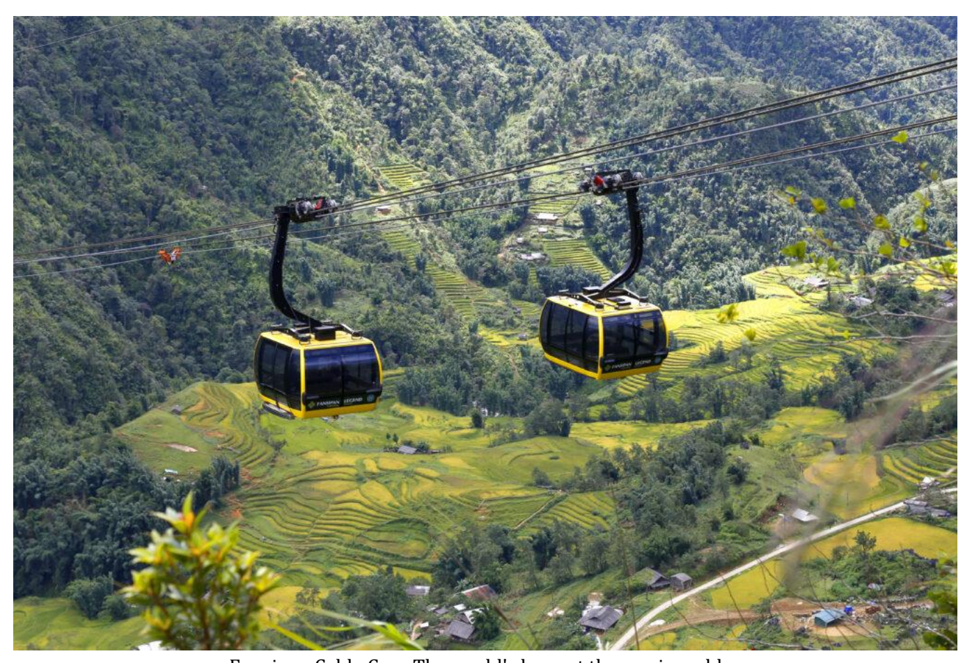
Fanxipan Cable Car - The world's longest three-wire cable car

Registered office: Villa 09, 310 Minh Khai Street, Minh Khai Ward, Hai Ba Trung District, Hanoi, Vietnam Trading office: 5th Floor, HH01 Building, New Horizon City, 87 Linh Nam street, Mai Dong Ward, Hoang Mai District, Ha Noi city, Viet Nam Tel: +84 24 3941 3748/49/50