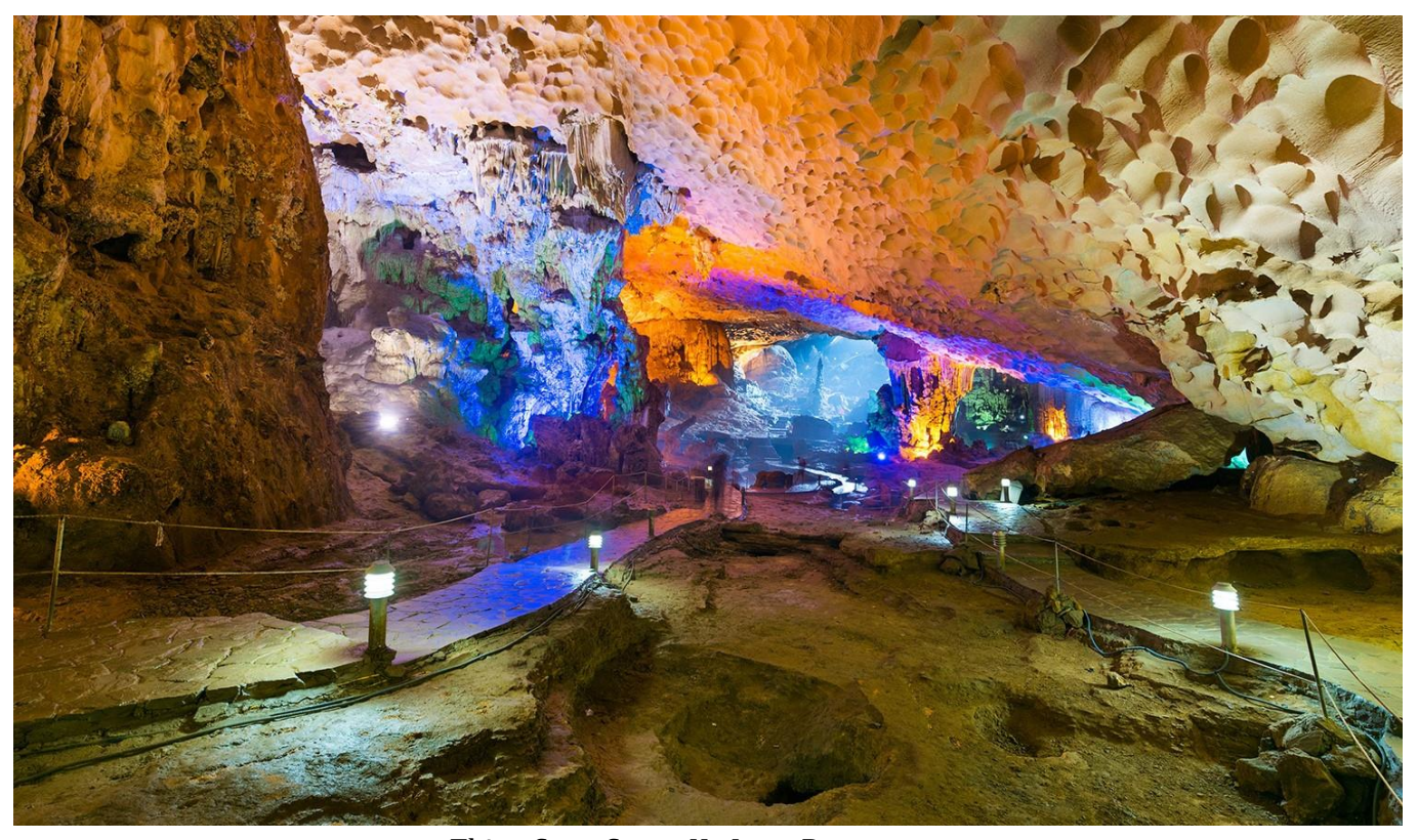
Thien Cung Cave _ Ha Long Bay

Registered office: Villa 09, 310 Minh Khai Street, Minh Khai Ward, Hai Ba Trung District, Hanoi, Vietnam Trading office: 5th Floor, HH01 Building, New Horizon City, 87 Linh Nam street, Mai Dong Ward, Hoang Mai District, Ha Noi city, Viet Nam Tel: +84 24 3941 3748/49/50